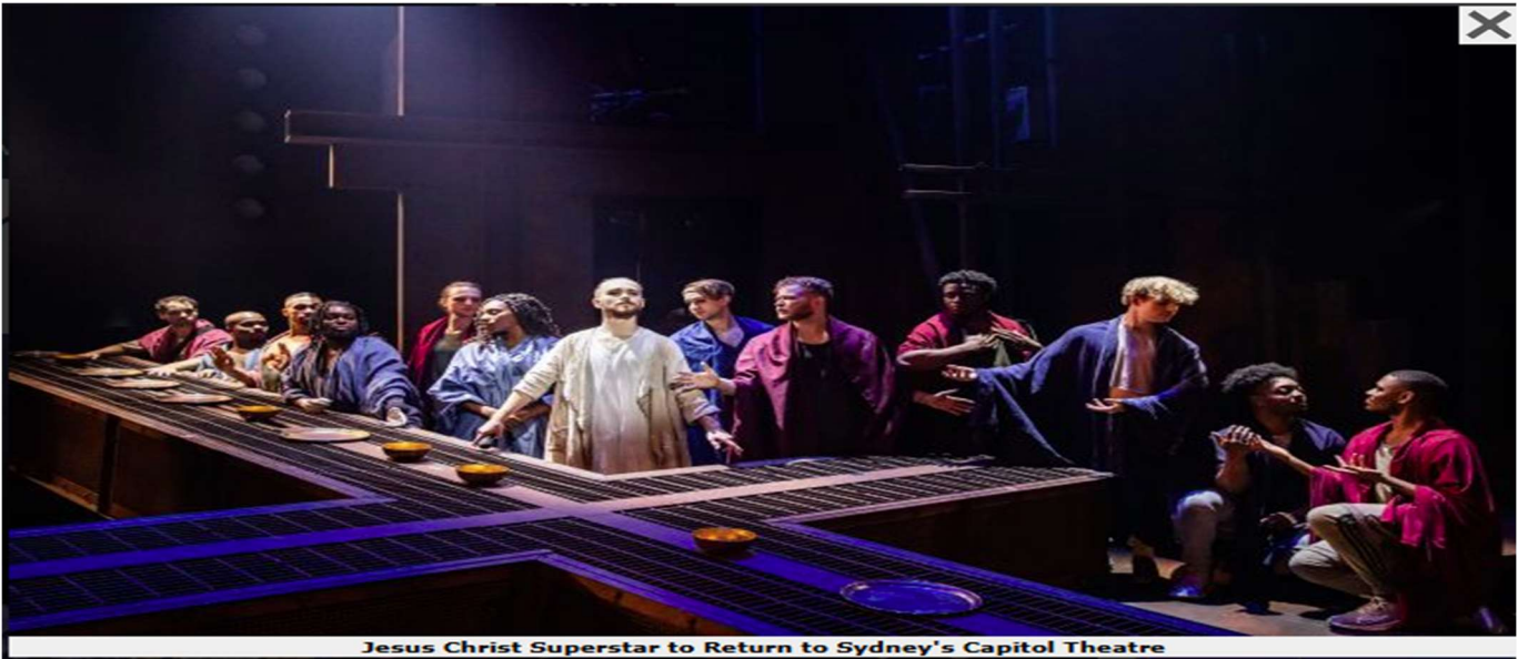
Jesus Christ Superstar to Return to Sydney's Capitol Theatre